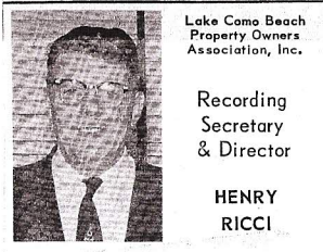
Lake Como Beach Property Owners Association, Inc.